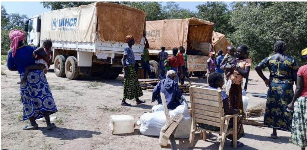
Chadian asylum seekers in Markounda, volunteer for relocation to the Betoko site.

1,233 Chadian asylum seekers, including 563 men and 670 women, were biometrically registered at the Betoko site. The CNR, with support from UNHCR, plays a central role in coordinating the protection of forced displaced people and groups of people with specific needs in host communities.