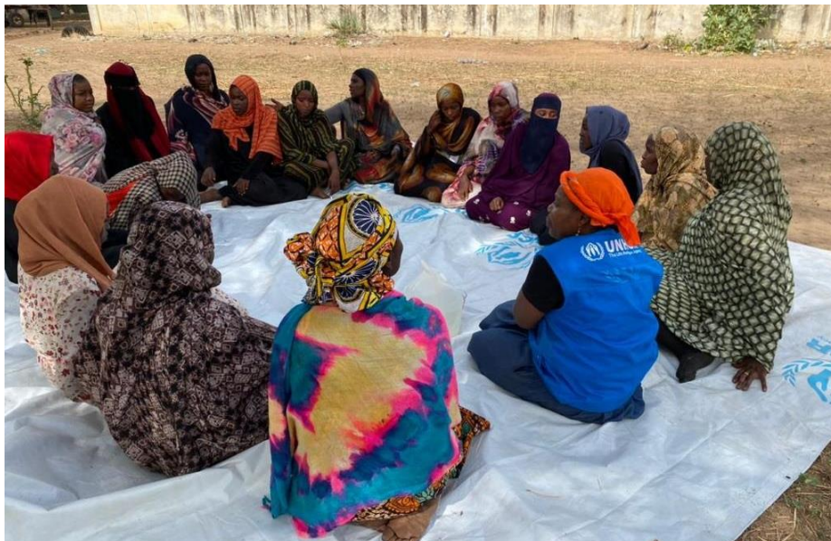
Psychosocial group session with girls and women who have experienced or witnessed abuse in Sudan.